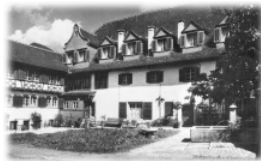
St. Andreas Kloster, Sarnen, Switzerland.