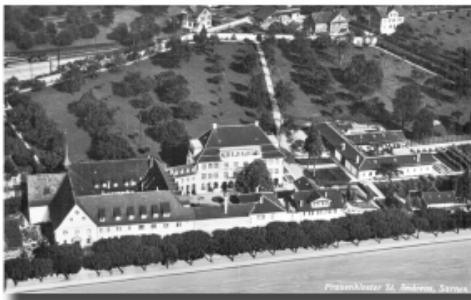
Aerial view of St. Andreas Kloster in Sarnen, Switzerland.